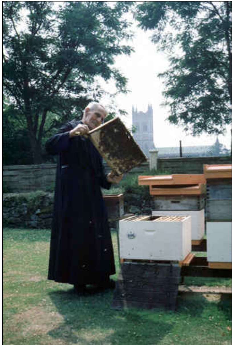
Brother Adam in his home apiary at Buckfast Abbey in 1983 showing the nice performance of one of his Greek combinations.

Let me say here that if you don't aim at fast progress, but just want to preserve or make a slow progress, making a mating apiary with your best colonies regardless of their genetic relationship is a good way, according to my own opinion. But when you cross different strains that are quite different genetically, you will in the next following generations get a quite wide variation, so you need a narrowing of the genetic upset of the droneside to make progress with a reasonable speed.